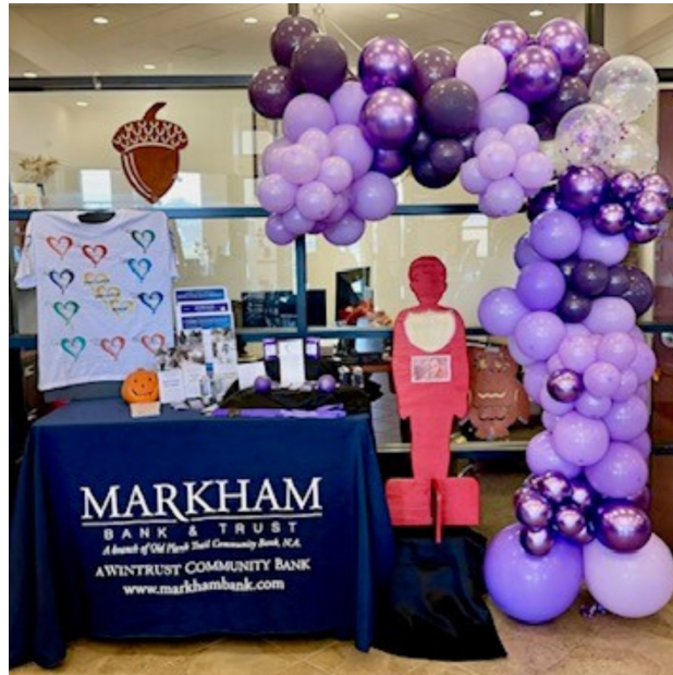
Awareness Display Pictured Above, by Markham Bank & Trust

As Domestic Violence Awareness Month (DVAM) comes to a close, I'm reminded of the critical role awareness plays in our community. At this month's Sneaker Ball, attendees learned more about our Housing Program and were amazed at the depth of our work and commitment to survivors. Many people we meet in the community don't realize who we are or that we've been serving the south suburbs for nearly 45 years.