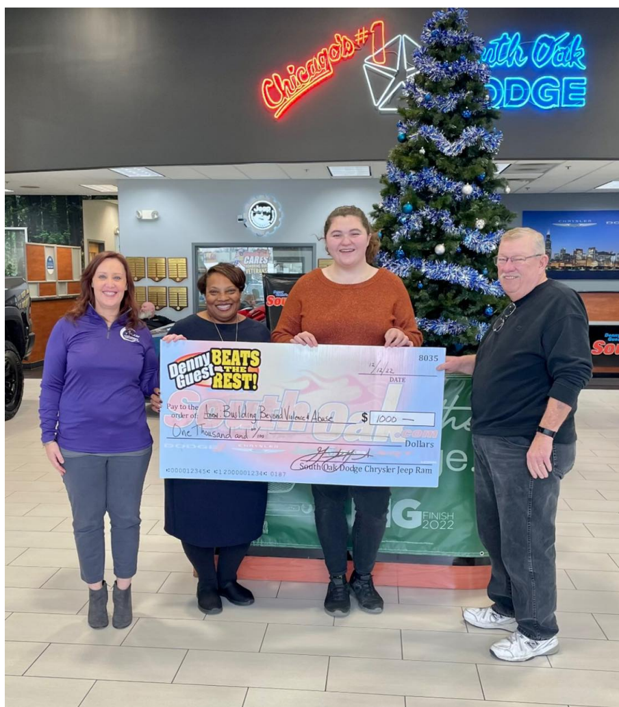
South Oak Dodge provided $1,000 in gift cards for our clients. This will certainly help our clients get the items they need to create a safe home!

Thank you to everyone who donated in 2022. Your belief and solidarity in our mission to end domestic violence in our shared communities does not go unnoticed. We cannot wait to see what 2023 has to offer!