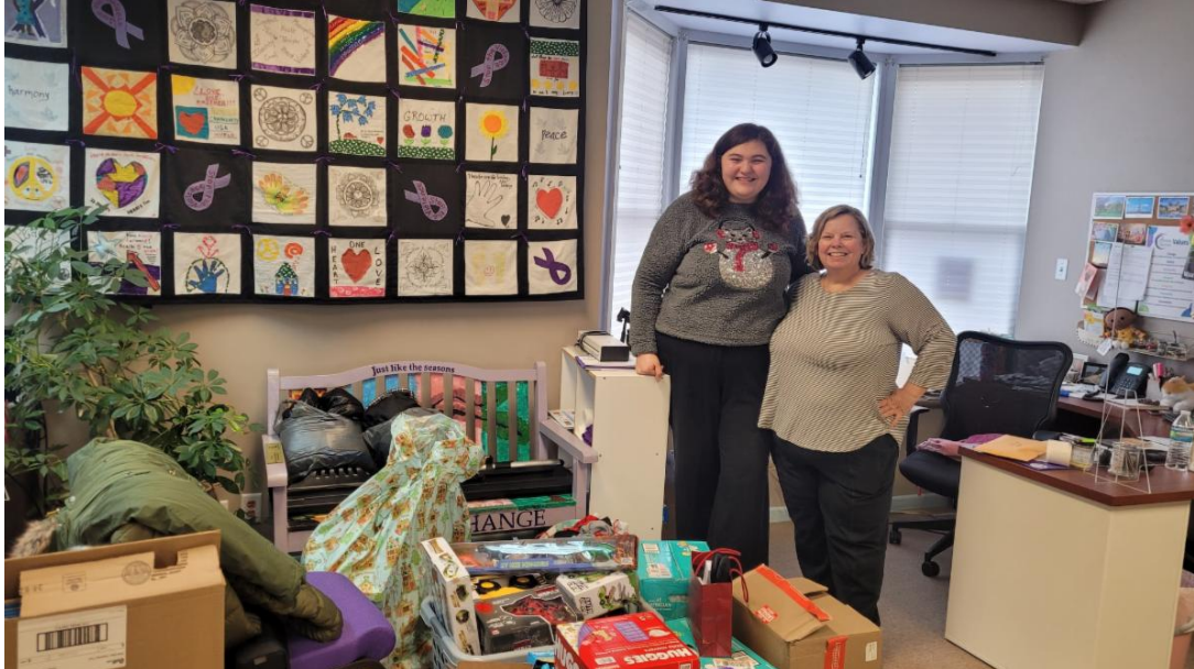
Flossmoor Community Church provided some wonderful toys and gift cards for our clients! It was such a special treat!